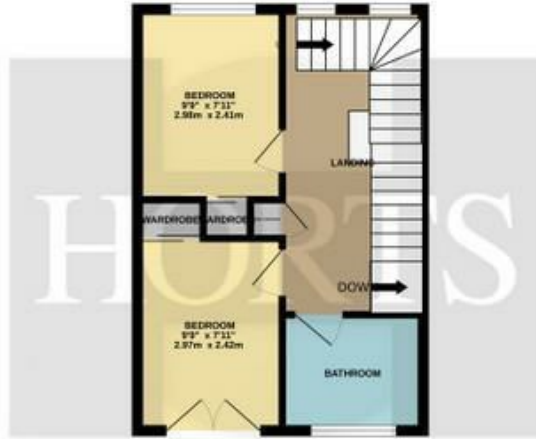
1ST FLOOR 333 sq.ft. (30.9 sq.m.) approx.